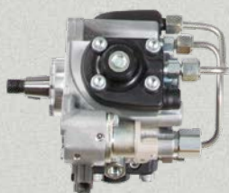
Fuel injection pumps