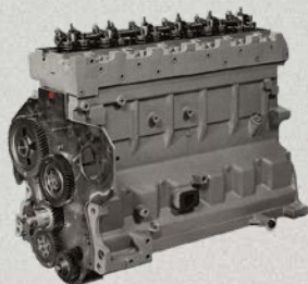
Complete block assemblies