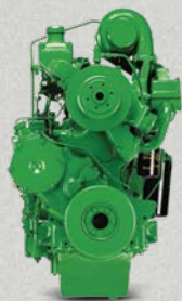
Complete and basic engines