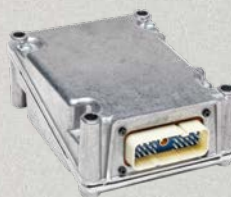
Electronic Control Unit (ECU)